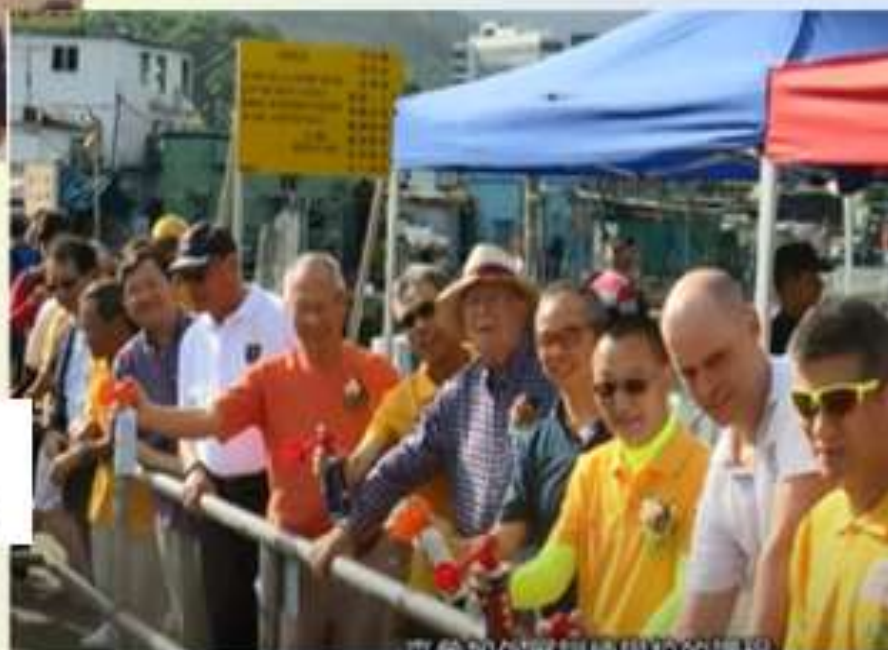
Officiating the start of the OBAA Hong Kong Macau Canoe Expedition