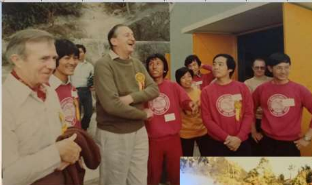
Sir David showed the Governor around the OBAA Clubhouse.