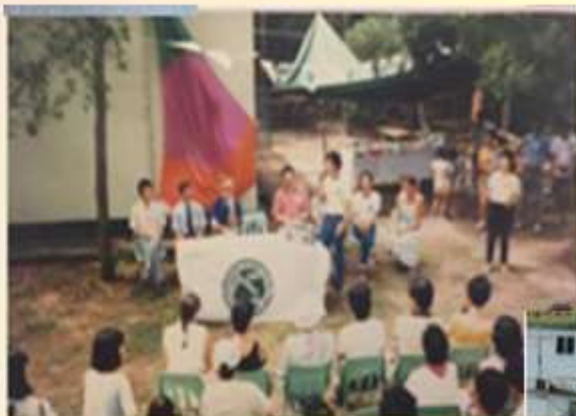
Officiating Ceremony at OBAA Clubhouse