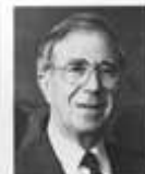
SIR DAVID AKERS-JONES PATRON THE OUTWARD BOUND (ALUMNI) ASSOCIATION OF HK

I HOPE THESE YOUNG PEOPLE WILL RECEIVE GENEROUS SUPPORT IN THEIR OWN SPECIAL EFFORT TO HELP THE HANDICAPPED.